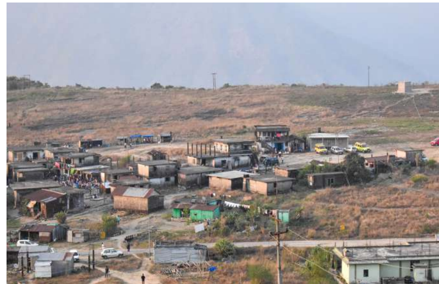
A glimpse of Nongkdait-Nongtwah Village

Bah Maxstarwell added that the IVCS has brought about socio-economic development not just in the village but in the entire cluster. Having an institution that provides financial services in the village has helped many farmers take up expanded activities due to the easy access to credit. Plans include leveraging the tourism potential of the village and turning it into another income-generating activity of the IVCS